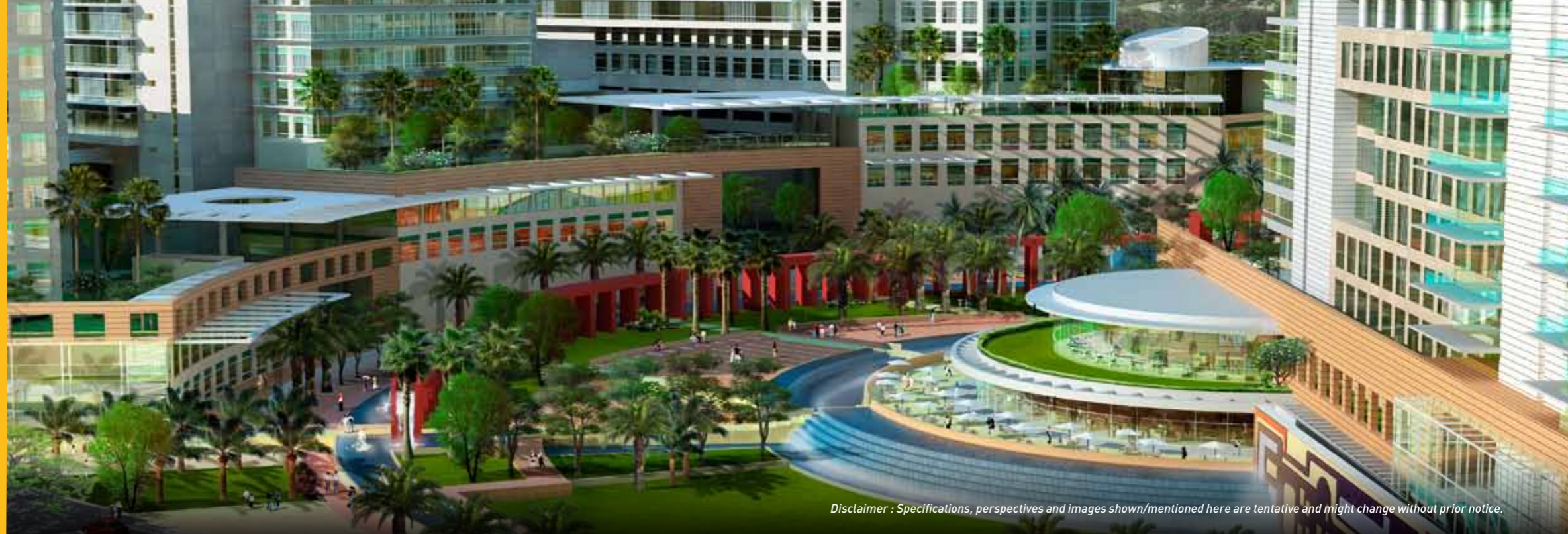
Disclaimer: Specifications, perspectives and images shown/mentioned here are tentative and might change without prior notice.

Set amidst lush landscaping, with an aesthetically appealing view of the rolling hills of the Deccan plateau, ITPP is the ideal business environment where creativity and ideas can bloom. The Park embodies the unique Ascendas Advantage – a perfect blend of high quality business space, reliable solutions and an international business lifestyle second to none.