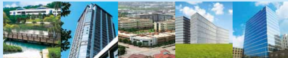
Singapore Science Park, Singapore Ascendas Plaza Shanghai, China Ascendas-Xinsu Suzhou, China Dalian Ascendas IT Park, Dalian, China CitiBank Center Seoul, South Korea

In November 2002, Ascendas launched Singapore's first business space trust, known as the Ascendas Real Estate Investment Trust, or A-REIT. In August 2007, a-iTrust was launched as Asia's and Singapore's first listed Indian property trust. In November 2006, it participated in A-KOF, an office fund in Korea. From June to August 2007, Ascendas also launched a series of private funds, namely Ascendas India Development Trust (AIDT), Ascendas ASEAN Business Space Fund, Ascendas China Commercial Fund (ACCF) and Ascendas China Industrial & Business Parks Fund (ACIBPF).