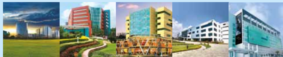
ITPB Bangalore The V Hyderabad Ascendas OneHub Gurgaon CyberVale Chennai ITPC Chennai

In June 2007, Ascendas launched the Ascendas India Development Trust (AIDT), a private real estate fund focusing on integrated property development projects. In August 2007, the Ascendas India Trust (a-iTrust) was launched as Singapore's first listed Indian property trust.