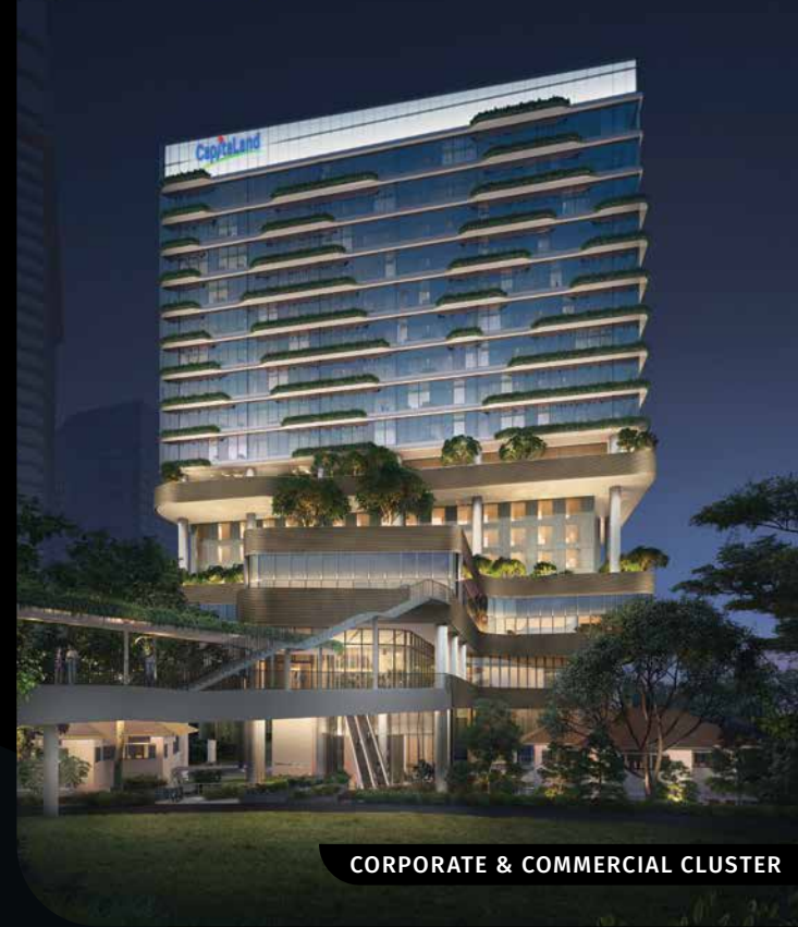
CORPORATE & COMMERCIAL CLUSTER