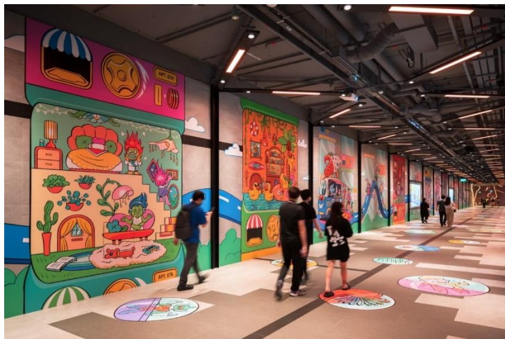
The Gachartment Complex by Nikkei. Light to Night Singapore 2024: Reimagine.

Singapore, 5 March 2024 – CapitaLand and National Gallery Singapore are thrilled to announce the renewal of their partnership for the second consecutive year, promising a wave of innovative art installations and immersive experiences for visitors. This collaboration underscores the organisations' shared commitment to enrich Singapore's cultural landscape and make art accessible to all.