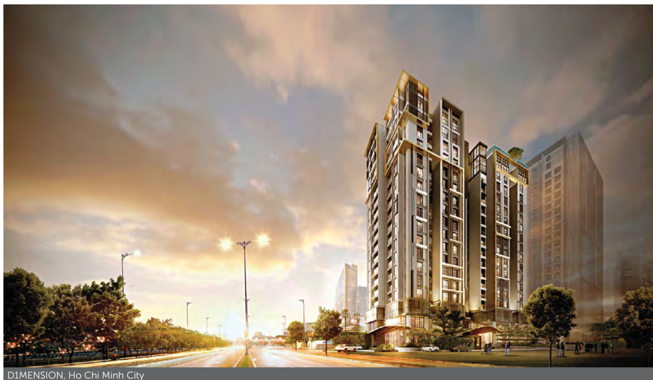
D1MENSION, Ho Chi Minh City

With a 23-year track record delivering quality projects, CapitaLand is committed to be a long-term partner in Vietnam's growth story. We will continue to explore opportunities to grow our market share.